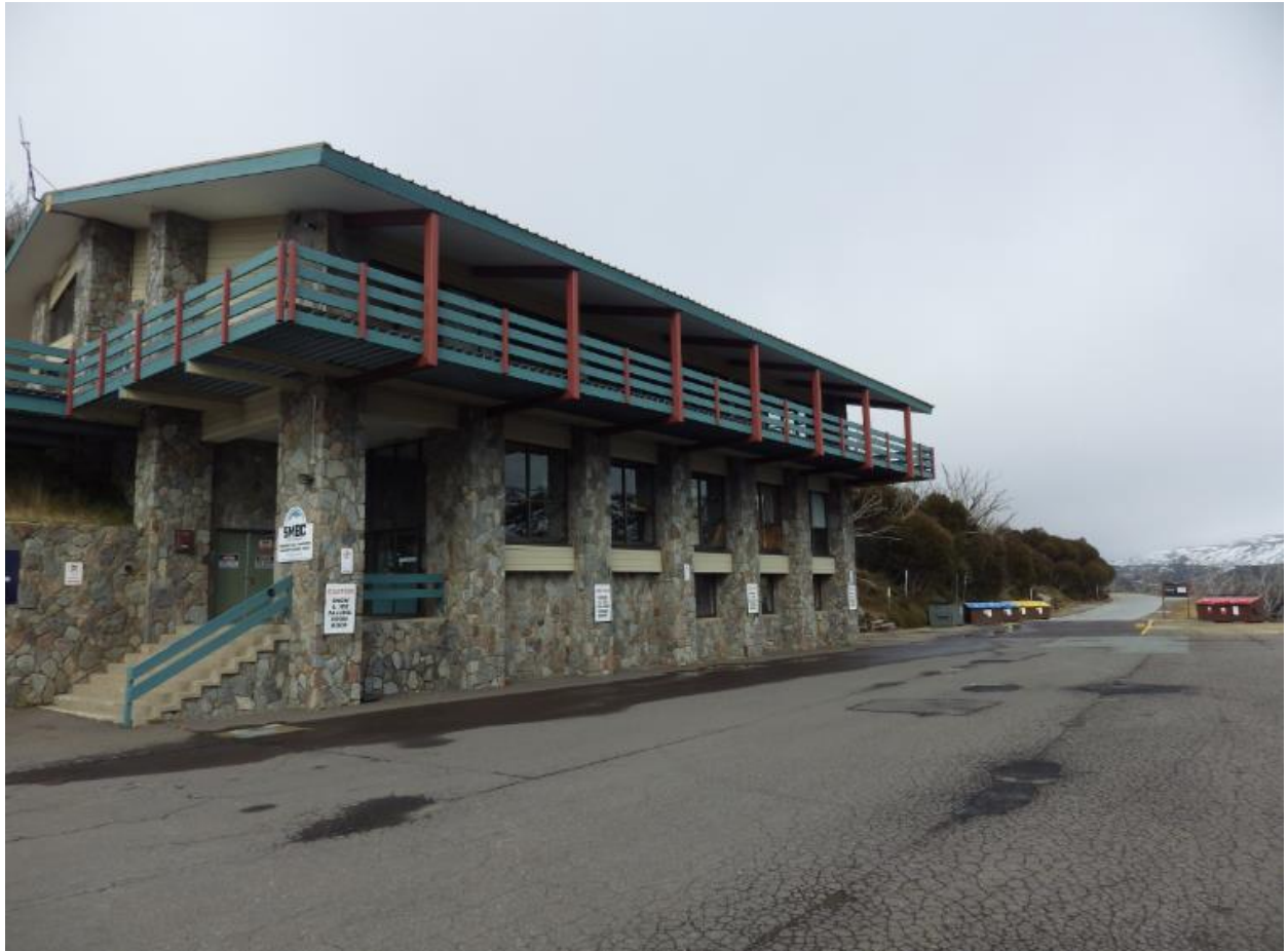
Figure 2 | Guthega Ski Centre

The site is located within the Guthega Ski Centre in Guthega. The building is located at the base of the 'car park double chair' and is the first building as you drive into Guthega. The building is three levels at the road frontage with a fourth level at the rear that contains public toilets. It was constructed in the mid 1980s using timber, alpine style stonework and masonry construction ( Figure 2 ).