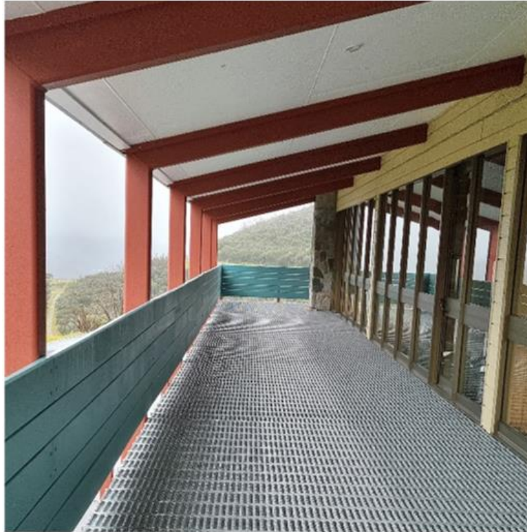
Figure 4 | Photo of balcony area