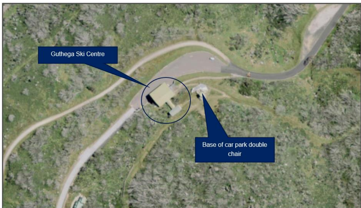
Figure 1 | Guthega Ski Centre, Guthega

The Minister for Planning is the consent authority for development within a ski resort in KNP and the proposal is permissible with consent under the provisions of State Environmental Planning Policy (Precincts – Regional) 2021 (the Precincts – Regional SEPP).